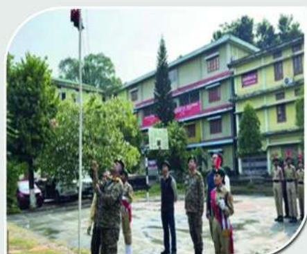
77th National NCC Day organised by 5th Assam Bn, Tezpur College NCC on 23rd Nov, 2025.