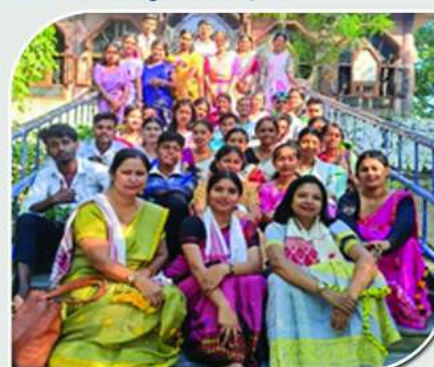
A Cultural Exchange Programme was organized in between department of Assamese, Tezpur College and GNDGC College, Nagaon on 20th Nov, 2025.