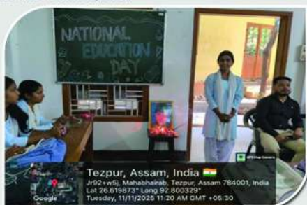
Department of Education, Tezpur College observed National Education Day on 11th Nov, 2025 to commemorate the birth anniversary of Maulana Abul Kalam Azad, by delivering inspiring speeches highlighting his invaluable contributions to the field of education.