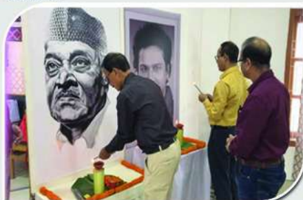
The birth centenary of Sudha Kantha Bharata Ratna Dr. Bhupen Hazarika's was observed in the college on 13th Nov, 2025.