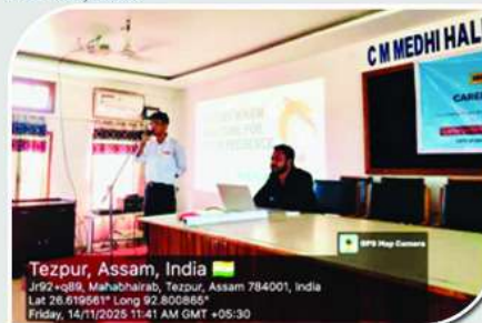
An Awareness Programme on Career Guidance was organized on 14 November 2025 at the C.M. Medhi Conference Hall, Tezpur College, by the Tezpur College Students' Union in collaboration with the Career Counselling Cell and IQAC.