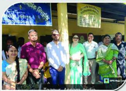
Department of History, Tezpur College, visited Tol Gereki Prathomik LP School and planted trees as part of its green initiative, making students understand the importance of trees in protecting the environment on 7th November, 2025.