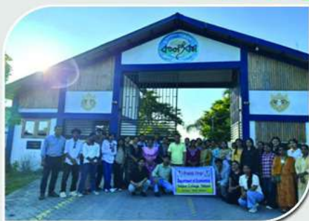
Educational Field Trip to Kanyaka, Jamuguri by 3rd Semester Students, Dept. of Economics, Tezpur College on 7th November, 2025.