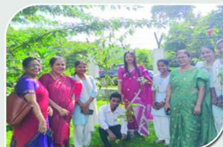
Community Service Program (Tree plantation) was organised by the Department of Philosophy, Tezpur College at Groh Doul Smoshan kshetra, Deurigaon area, Tezpur on 11th Nov, 2025.