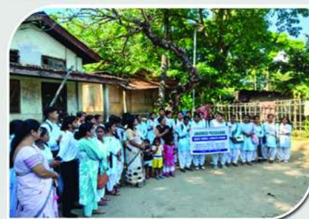
A public awareness programme against drugs was organized at the old village of Katan Road nearby Cotton Road, under the initiative of Assamese Department on 8th Nov, 2025.