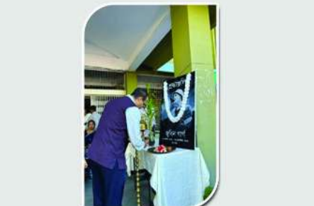
The 53rd birth anniversary of the legendary artist Zubeen Garg was celebrated on the college premises on 18th Nov, 2025.